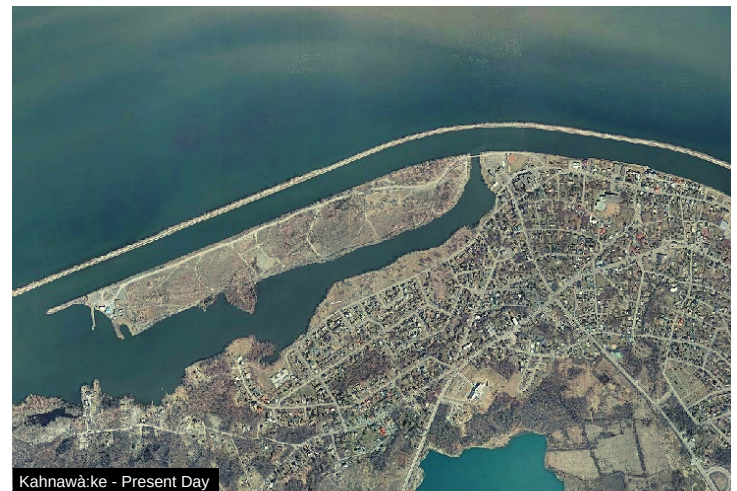
Kahnawà:ke - Present Day