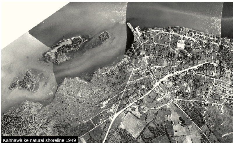
Kahnawà:ke natural shoreline 1949